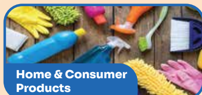
Home & Consumer Products