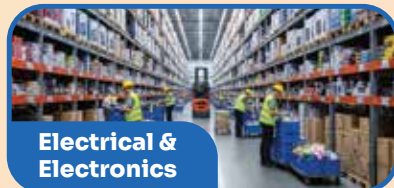
Electrical & Electronics