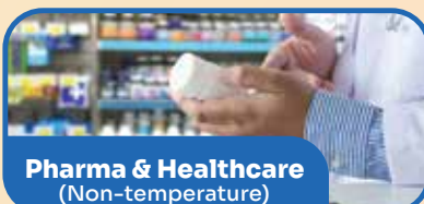
Pharma & Healthcare (Non-temperature)