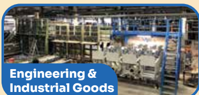
Engineering & Industrial Goods